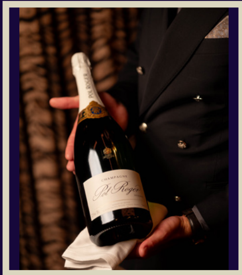
MAGNUM, POL ROGER CHAMPAGNE

A magnum of classic French Champagne, crisp and elegant. Ideal for Champagne arrivals, toasts and setting the tone for the celebration.